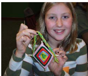
Mexican Huichol Indian Yarn Crafts

For more information and other programs please visit: