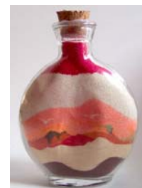
Discover the Desert